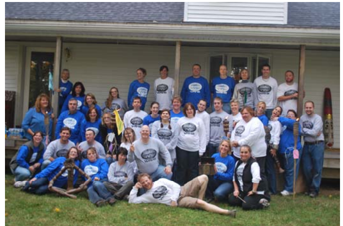
WRHS faculty and staff Survivor team building event.